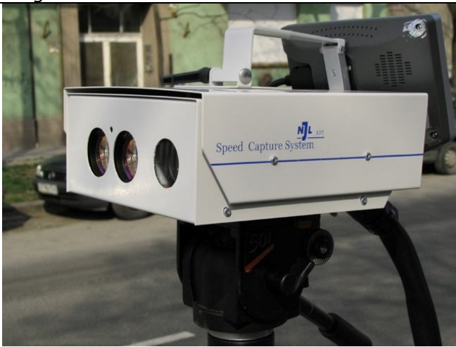
NJL Kft - SCS-101/SCS-102