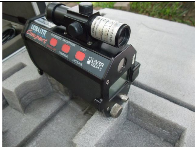
Utralyte 20-20 100RL