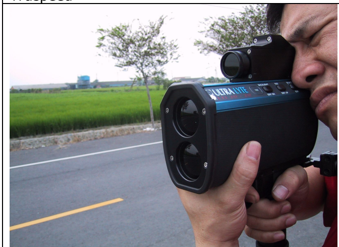
Utralyte 20-20 100