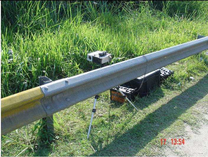
Riegl - LR90-235