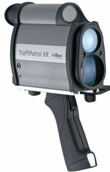
Traffic patrol XR