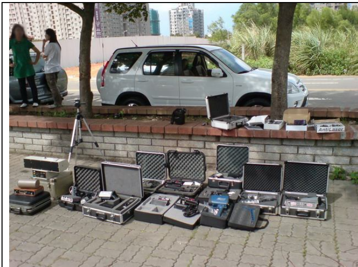
All Speed guns are tested by our development team.

The install kit supplied is the most comprehensive of any system available and makes fitting of the M45 laser system very simple and easy. It is compatible with all laser guns/Laser speed system from anywhere in the world including: