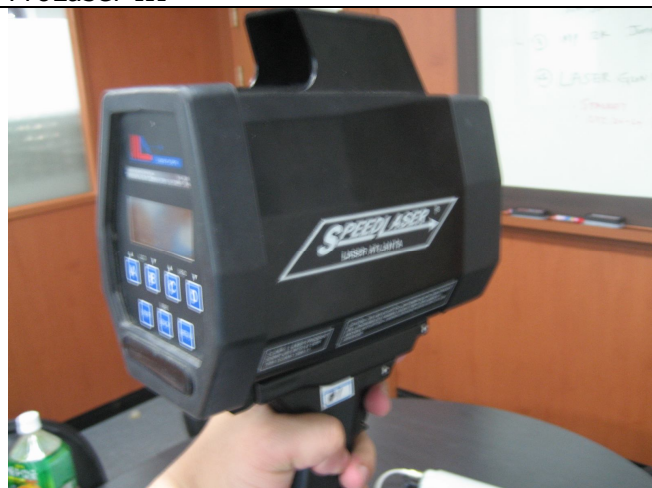
Laser Atlanta - SpeedLaser, S, R, Stealth Mode