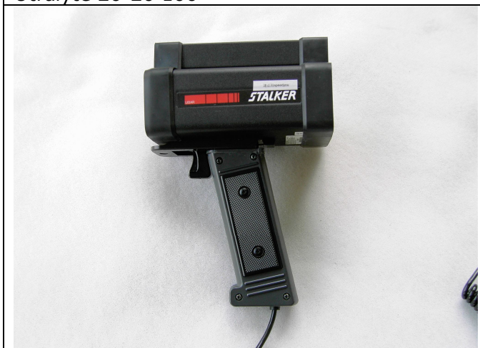
Stalker - LZ-1