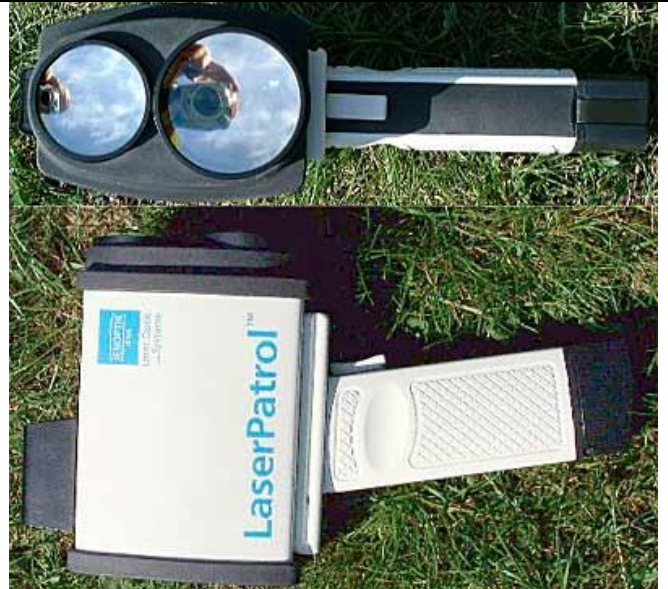
Jenoptik – LaserPatrol